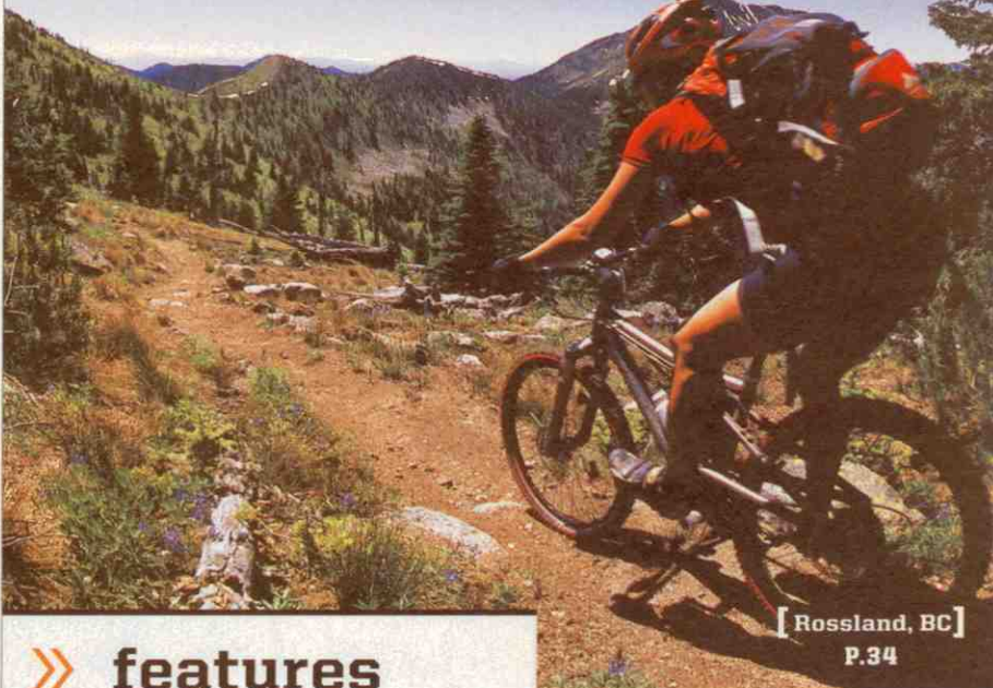
[ Rossland, BC ] P.34