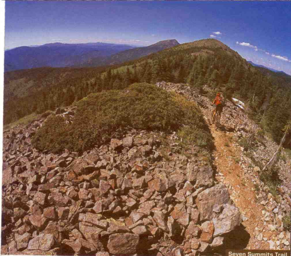
Seven Summits Trail

funded crew of locals that coordinates the cutting and maintenance of trails with an unheard of seven full-time summer staff. MOUNTAIN BIKING: The jewel of Rosslund's crown of crenellated cycling is the Seven Summits Trail, a 30-kilometre alpine cross-country ride that was the second trail in Canada to be awarded an "Epic" designation from the International Mountain Biking Association. The area also has plenty of arthritis-inducing downhill (one stretch of Oasis drops 1,400 feet over 3.6 kilometres), and Red Mountain's bike park. SKIING: If you're a serious skier, you already